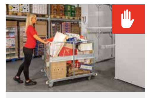
Convenient and quick loading