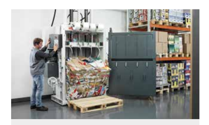
The bale is tipped by 90° due to the ejection. The specified width then becomes the bale height and the specified height becomes the bale width. The bale length remains the same.