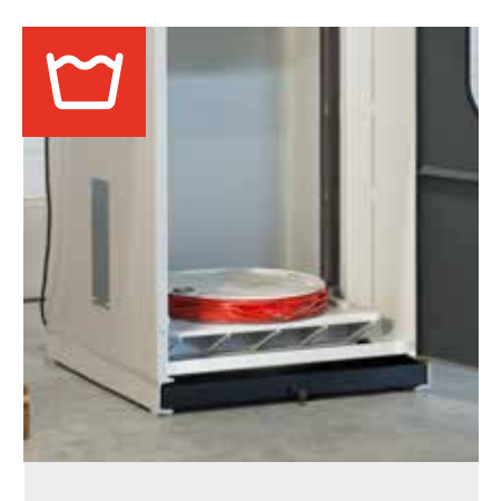
Collector tray for residual liquid