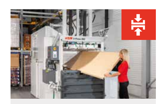
Compresses bulky cardboard with no problem