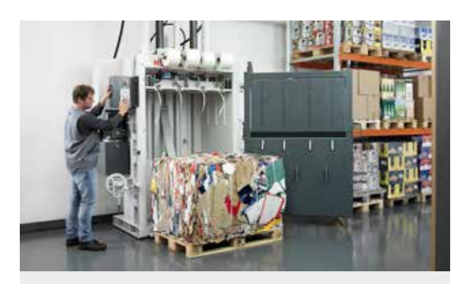
The height (in the compaction chamber) / length (after ejection) of the bale varies depending on the expansion force of the pressed bale.