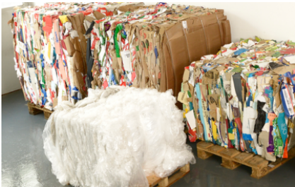
Suitable for cardboard as well as film