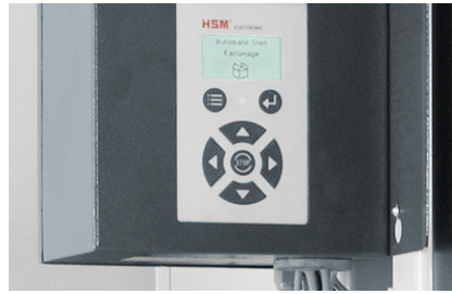
Convenient membrane keypad with text display, which shows the current status of the machine