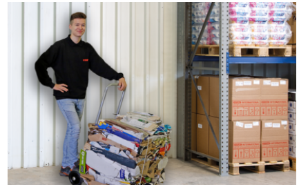
Bale removal and transport with discharge trolley