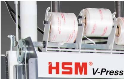
Manual bale strapping with continuous polyester tape