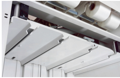
Massive press ram and extremely robust press plate guidance