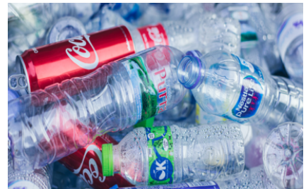
Compacts PET and beverage cans