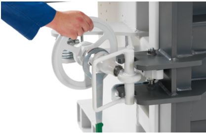
Hand wheel door lock - Easy to handle thanks to counter-rotating thread for quick opening and closing