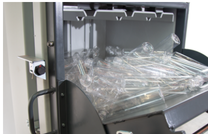
Simple loading thanks to the filling flap at a convenient working height.