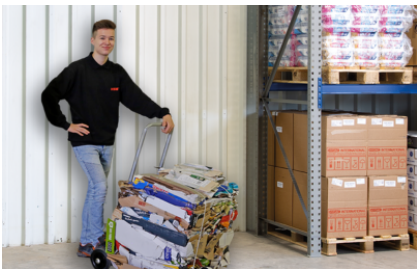
Bale removal and transport with discharge trolley