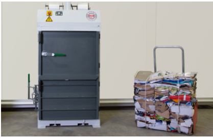
Low installation height and small footprint