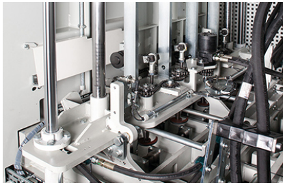
Fully automatic vertical strapping