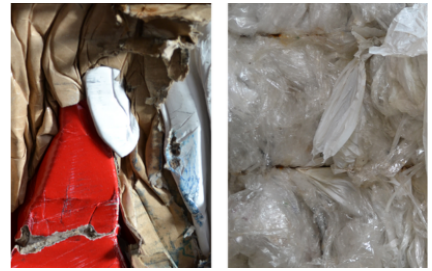
Particularly suitable for compression of cardboard and plastic film