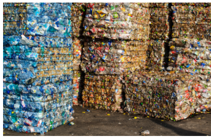
High compression and bale weights