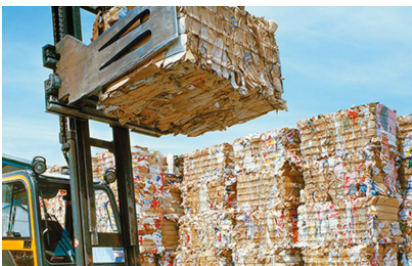
Particularly suitable for compression of paper, cardboard and plastic film