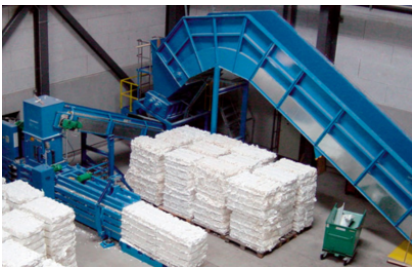
Integration into automated industrial production processes