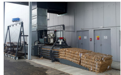
Suitable for almost all requirements. Contact us if you have other materials or applications. We will find you a suitable solution.