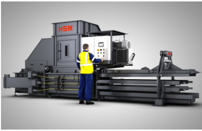
Very low space requirement thanks to compact and sturdy design