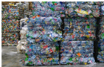
Compresses paper, cardboard, plastic film and PET bottles