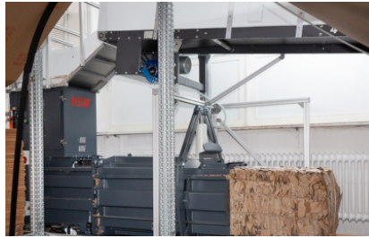
Integration into automated industrial production processes