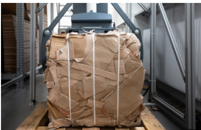
Available as an option with manual strapping