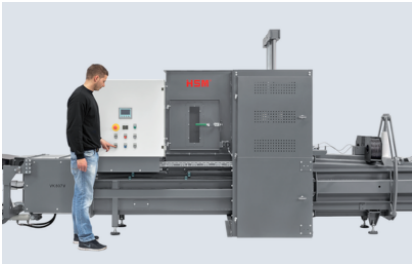
Operating side can be selected