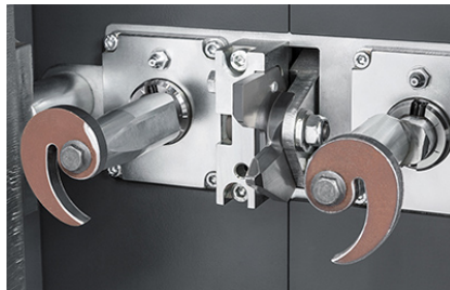
Solid steel construction with extremely wear-resistant, replaceable steel