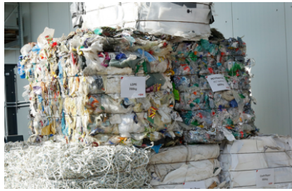
Suitable for cardboard, plastic film and compressing DSD goods, UBC as well as PET bottles (other materials on request)