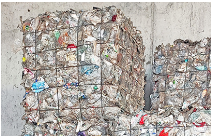
Available as an option with cross strapping