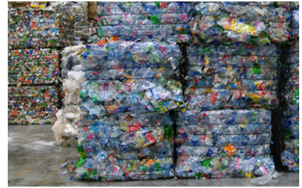
Particularly suitable for cardboard, plastic film and PET bottles