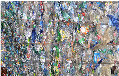
Ideal as compliment to the HSM baling presses