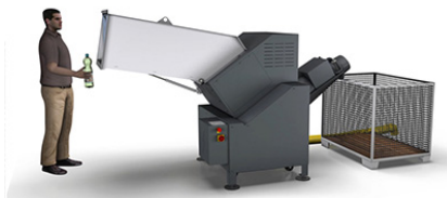
Both manual and automatic filling possible