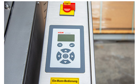
Intuitive, multilingual operational guidance via graphic description