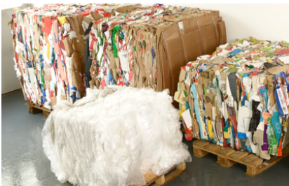
Suitable for cardboard as well as film