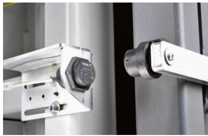
Automatic start of the pressing process after closing the door