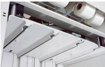
Massive press ram and extremely robust press plate guidance