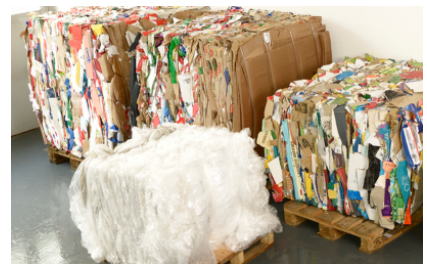
Suitable for cardboard as well as film