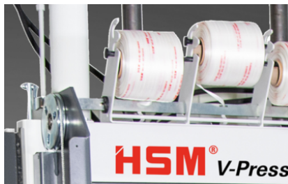
Manual bale strapping with continuous polyester tape