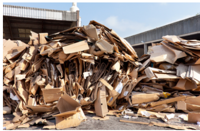
Versatile solution for materials up to approx. 60 kg /m 3 bulk weight