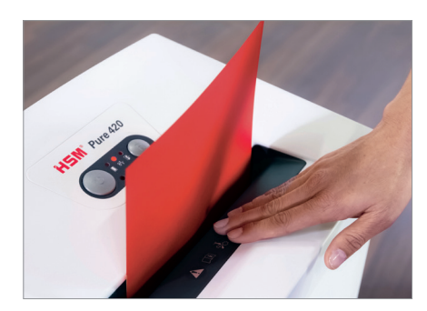
High level of user safety

The paper feed with overload protection reduces paper jams and sustains the high throughput of paper.