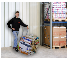
Bale removal and transport with discharge trolley