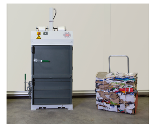
Low installation height and small footprint