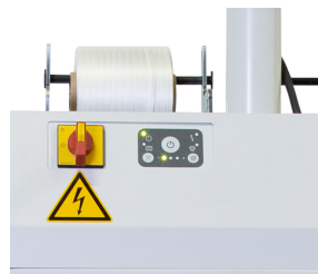
Microprocessor controller with membrane keypad