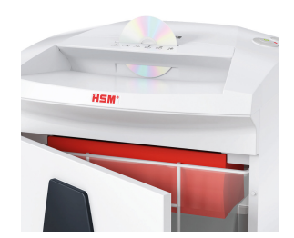
A separate collecting bag means that the shredder material can easily be sorted and separated for correct recycling.

The induction-hardened, solid steel cutting rollers with a lifetime warranty can easily cope with staples and paper clips and guarantee durability.