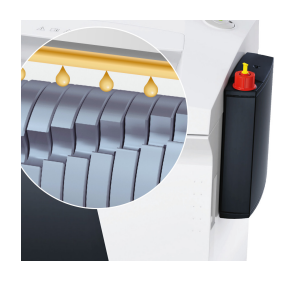
For a consistently high cutting performance, this low maintenance document shredder has an external automatic oiler as an option.