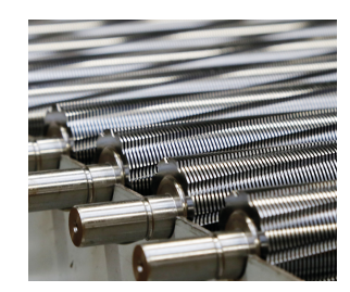
The induction-hardened, solid steel cutting rollers can easily cope with staples and paper clips and guarantee durability.